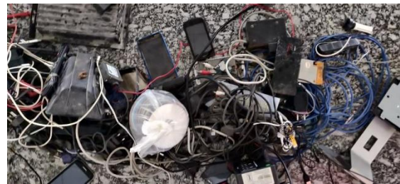
VIEW OF E-WASTE COLLECTION