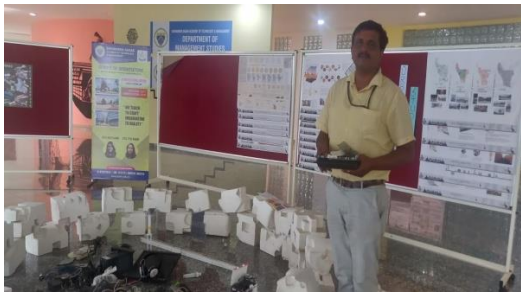
COLLECTION IN PROGRESS