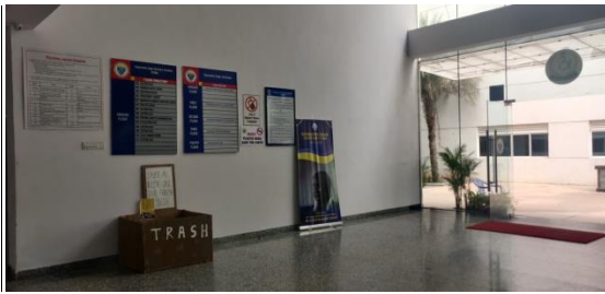
COLLECTION BIN AT SOA DSATM