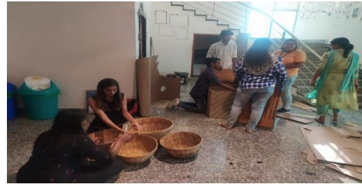
STUDENTS ACTIVE PARTICIPATION